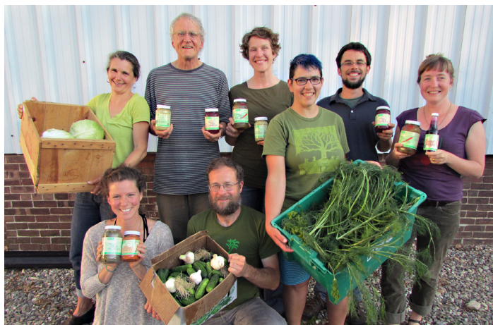
All of Real Pickle's vegetables are sourced from local, organic farms and distributed solely within the Northeast U.S. with the goal of supporting a regional organic food system.

NFCA is a cooperative network of 35 food co-ops and startups across New England that are working together to achieve a thriving cooperative economy rooted in a healthy, just and sustainable food system.